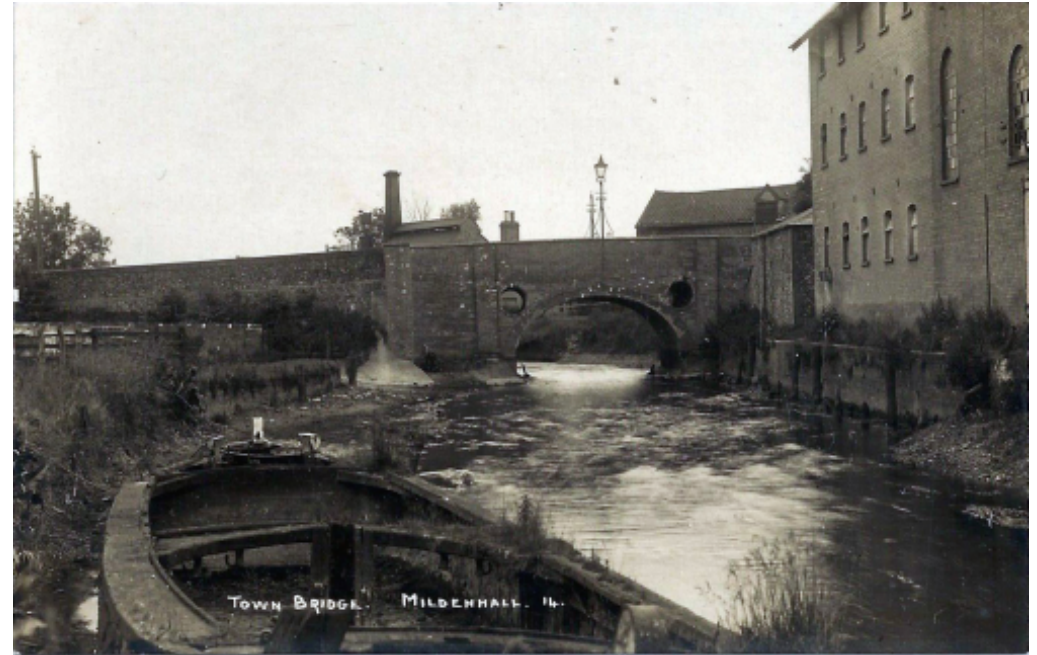
Town Bridge, Mildenhall, looking towards gasworks

First of a series of history walks in the Brecks, run by The Brecks Fen Edge and Rivers Landscape Partnership Scheme @TheBrecksLP supported by @HeritageFundUK, guided by @OSBrecks volunteers