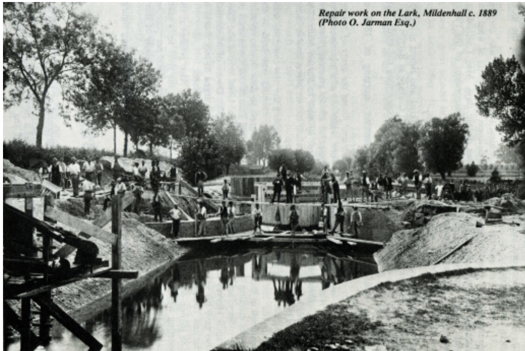
Repair work on the Lark, Mildenhall c. 1889