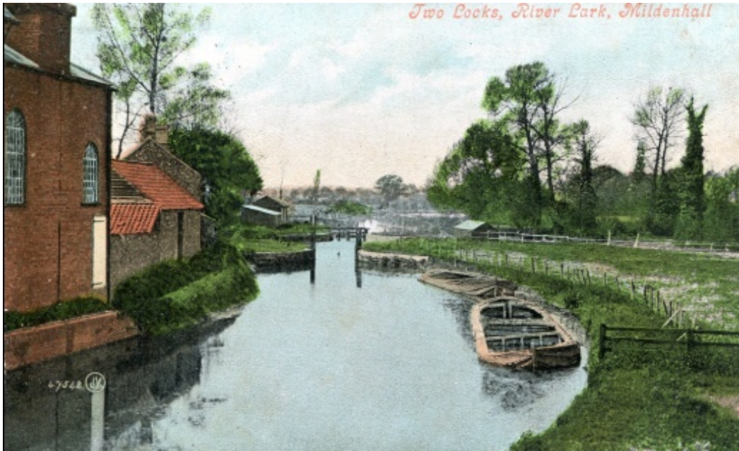
Turf Lock, Mildenhall, looking downstream, 1914