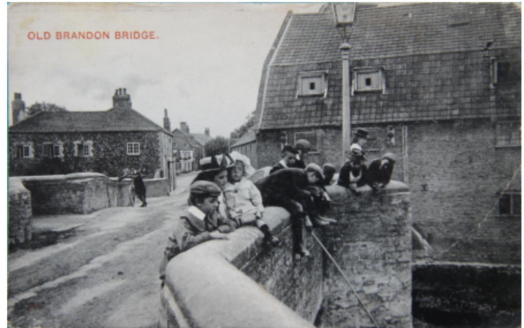
Old Brandon Bridge, postcard, c early 1900s