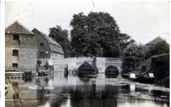
Brandon Old Bridge, maltings postcard, c early 1900s