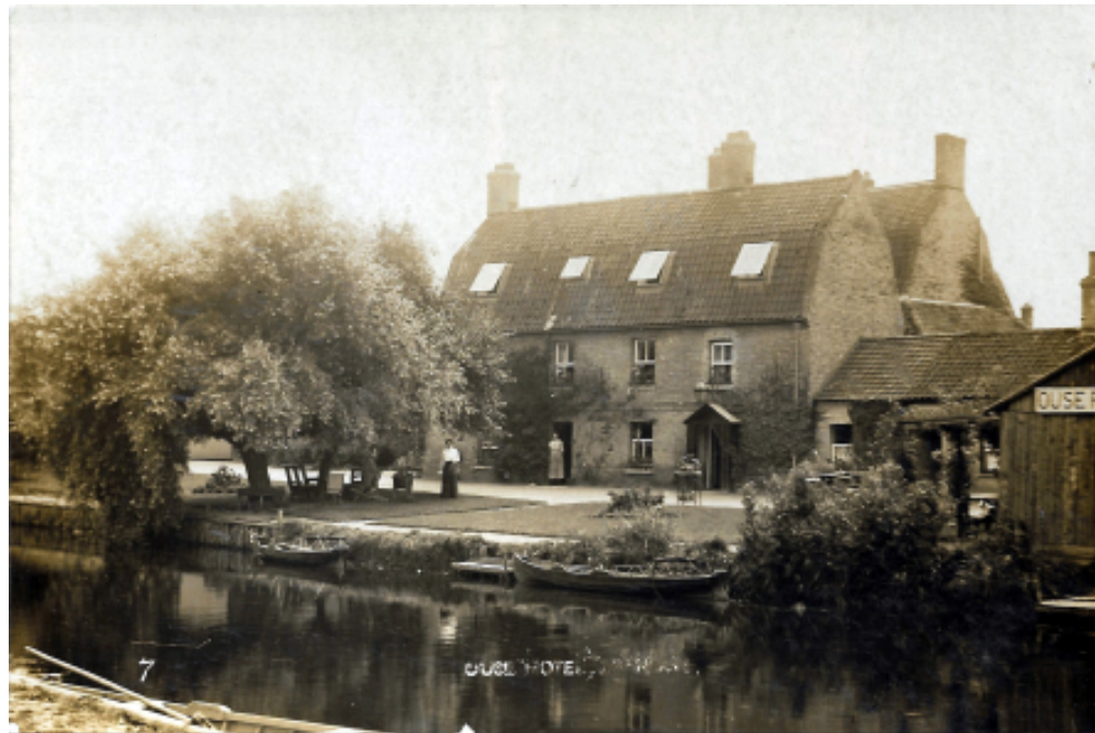
Ouse Hotel from the river, postcard, c early 1900s