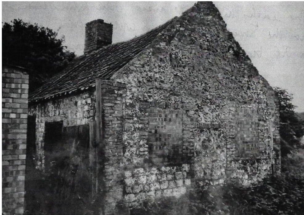
Old Wesleyan Chapel