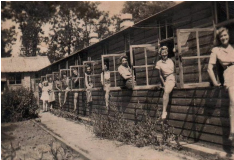
Celebrating the End of Service (circa 1945), Women's Land Army Hostel