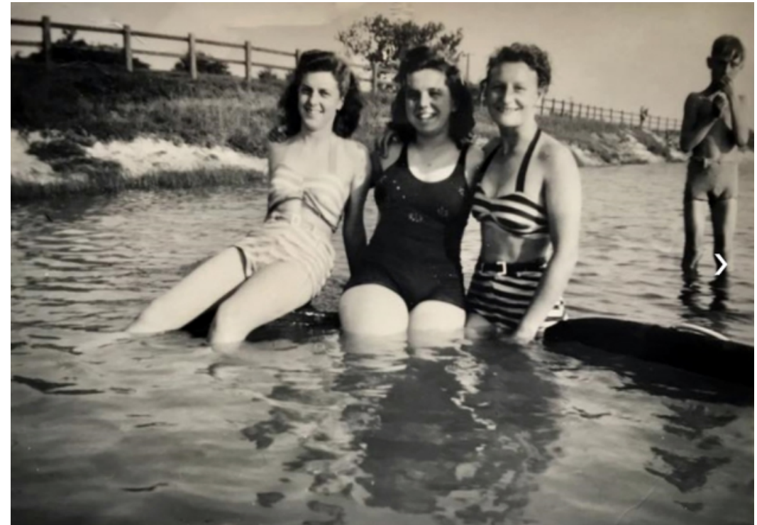
Lakenheath Mill Pond 1947

First of a series of Spring 2024 history walks in the Brecks, run by The Brecks Fen Edge and Rivers Landscape Partnership Scheme @TheBrecksLP supported by @HeritageFundUK, guided by @OSBrecks volunteers