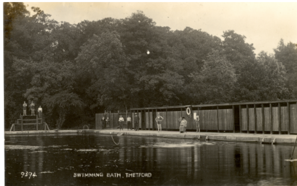
Thetford river swimming baths, about 1925.