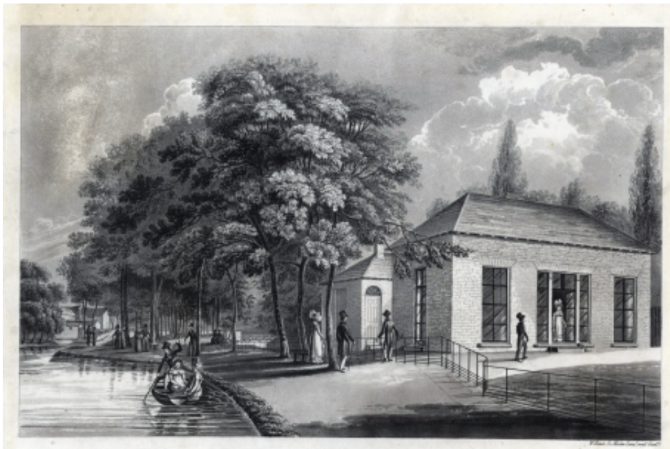
Thetford Spa