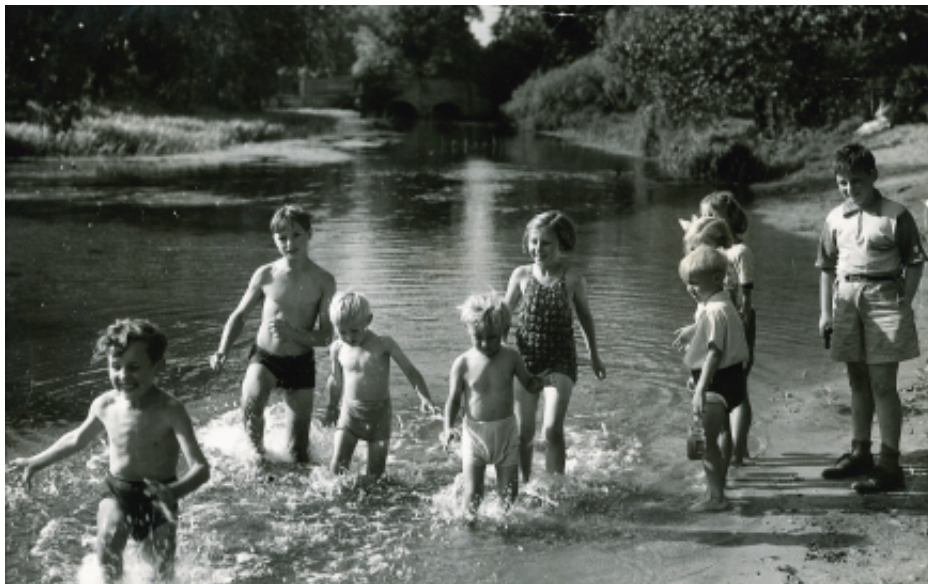
Children at Thetford river swimming baths, 1950

Second in a series of spring history walks in the Brecks, run by @TheBrecksLP, The Brecks Fen Edge and Rivers Landscape Partnership Scheme, supported by @HeritageFundUK, guided by @OSBrecks volunteers. Contacts: Imogen Radford, imogen36@googlemail.com; bfer.admin@suffolk.gov.uk