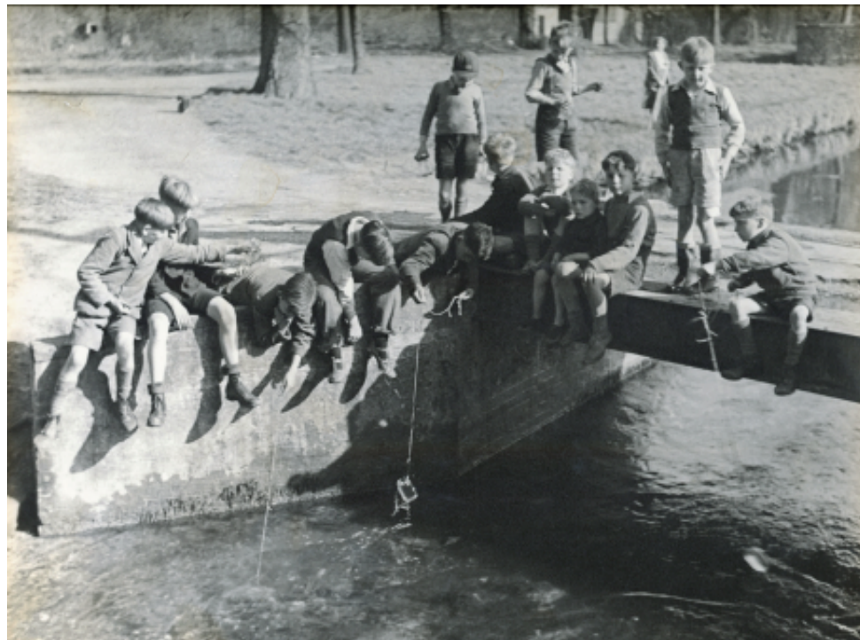
Children fishing at Thetford Iron Bridges 1954